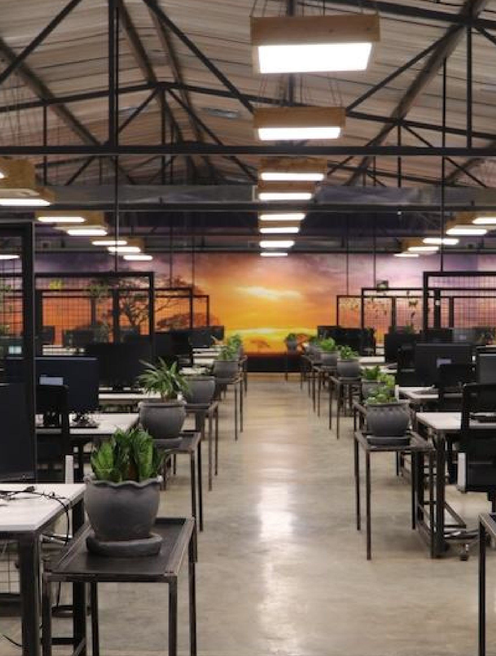
Sama Offices in Nairobi, Kenya